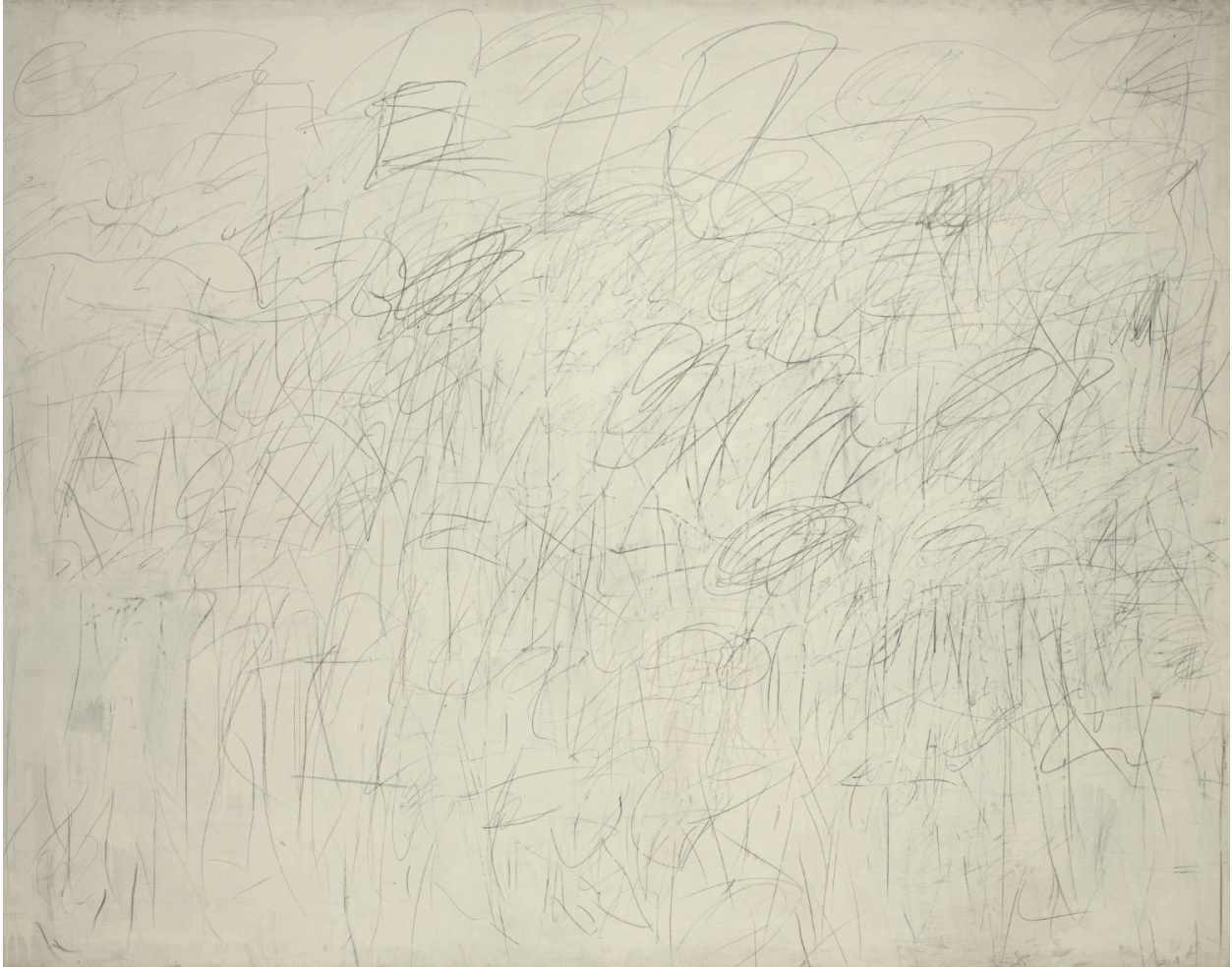
Cy Twombly. Academy . New York 1955

Warm-up: What words or mental images come to mind when you think about the phrase “acting out?” Make a list of as many words as you can.