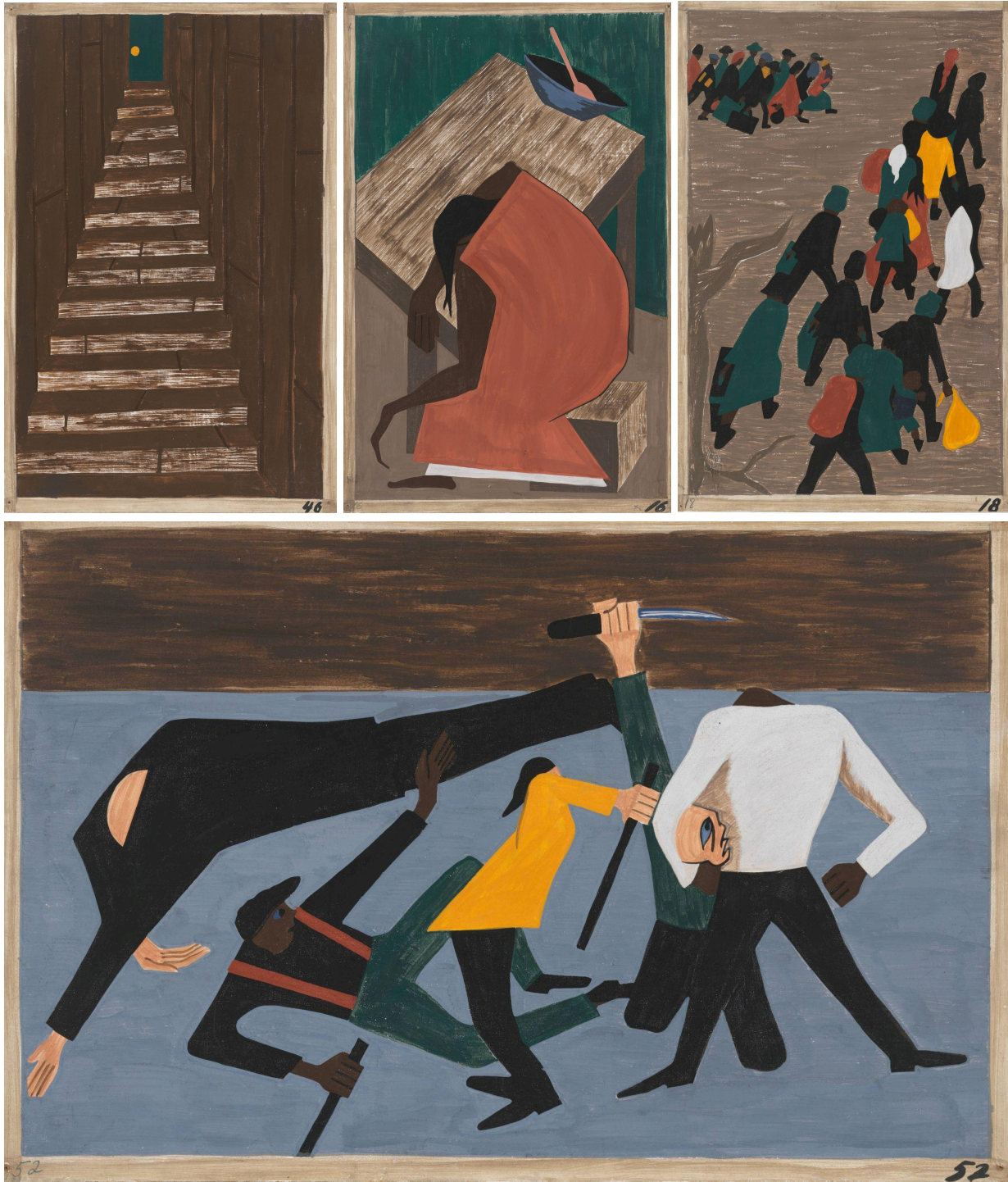
Jacob Lawrence. The migration gained in momentum. 1940-41; Jacob Lawrence. One of the largest race riots occurred in East St. Louis. 1940-41; Jacob Lawrence. Industries attempted to board their labor in quarters that were oftentimes very unhealthy. Labor camps were numerous. 1940-41; Jacob Lawrence. Although the Negro was used to lynching, he found this an opportune time for him to leave where one had occurred. 1940-41