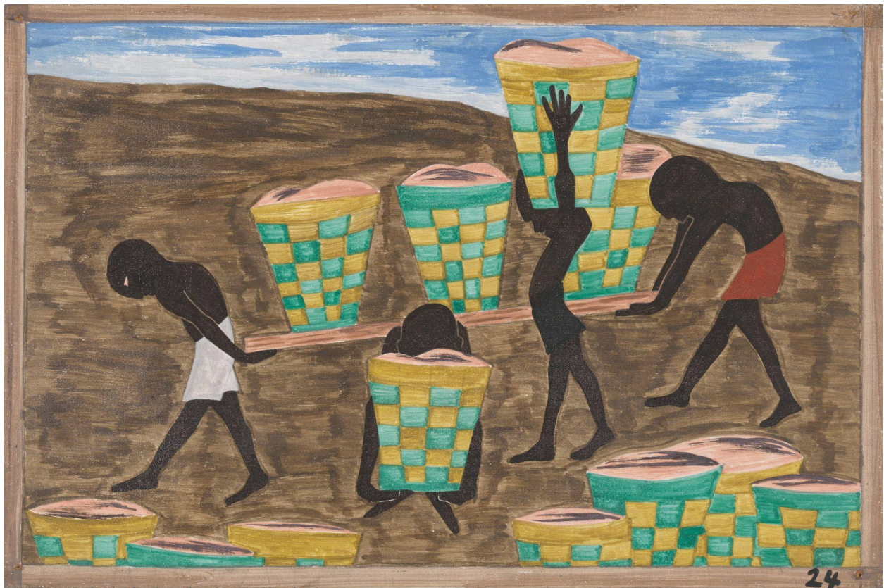
Jacob Lawrence. Child labor and a lack of education was one of the other reasons for people wishing to leave their homes. 1940-41

¿Qué sabe tu cuerpo de viajar? ¿Qué empacarías si no puedes llevarte todo? ¿Qué viaja en tus huesos y no en tus maletas?