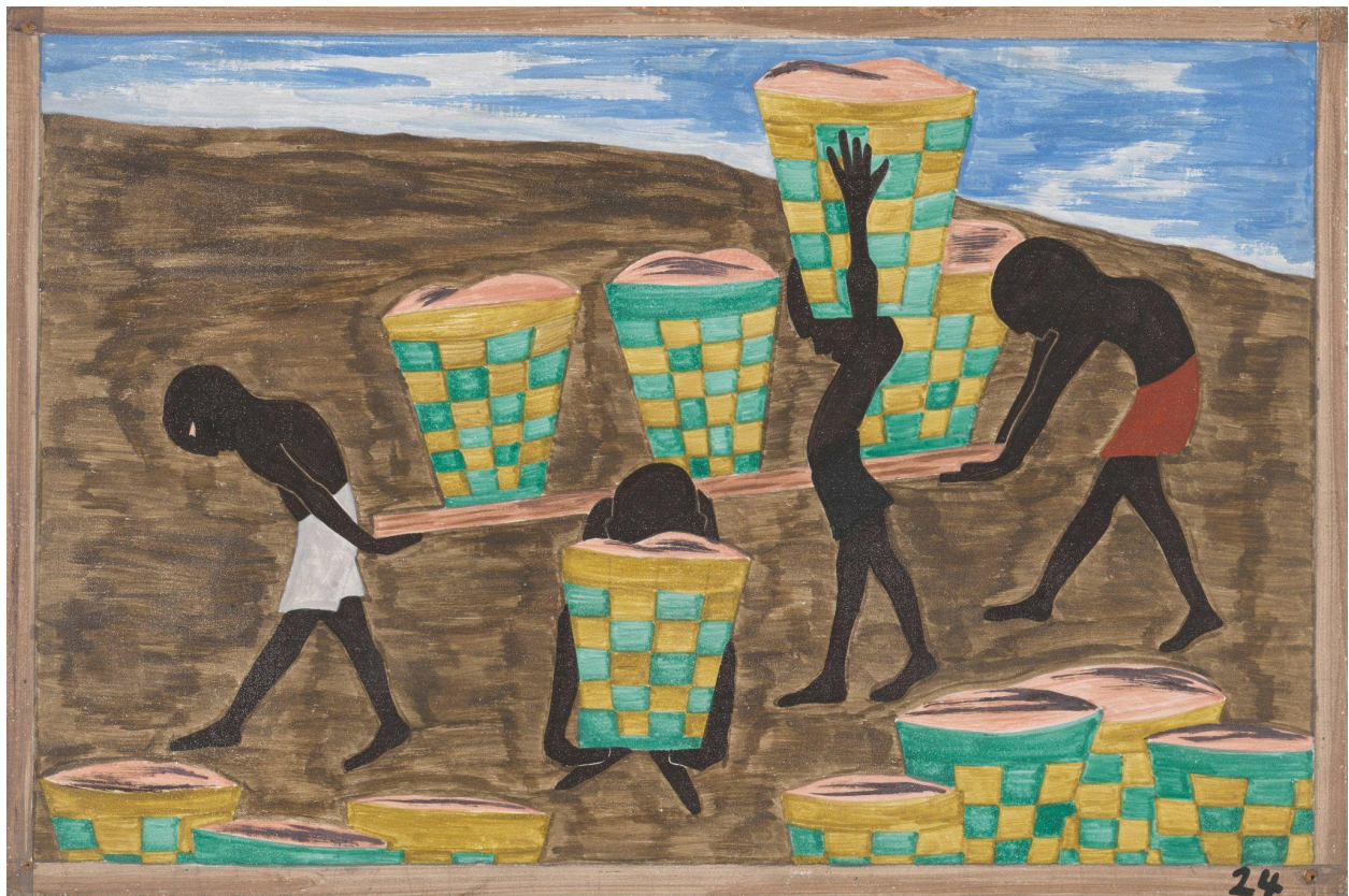
Jacob Lawrence. Child labor and a lack of education was one of the other reasons for people wishing to leave their homes. 1940-41

What does your body know about journeying? What do you pack when you cannot pack everything? What travels in your bones instead of your bags?