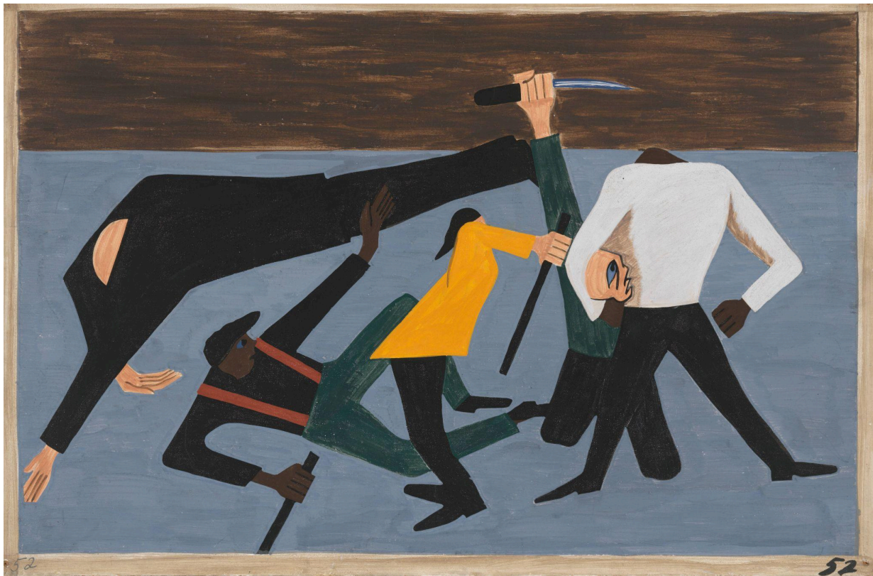
Jacob Lawrence. The migration gained in momentum. 1940-41; Jacob Lawrence. One of the largest race riots occurred in East St. Louis. 1940-41; Jacob Lawrence. Industries attempted to board their labor in quarters that were oftentimes very unhealthy. Labor camps were numerous. 1940-41; Jacob Lawrence. Although the Negro was used to lynching, he found this an opportune time for him to leave where one had occurred. 1940-41