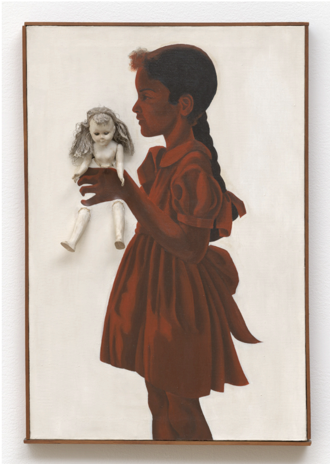
Artwork 2: Adrian Piper. Self Portrait at Age 5 with Doll. 1966