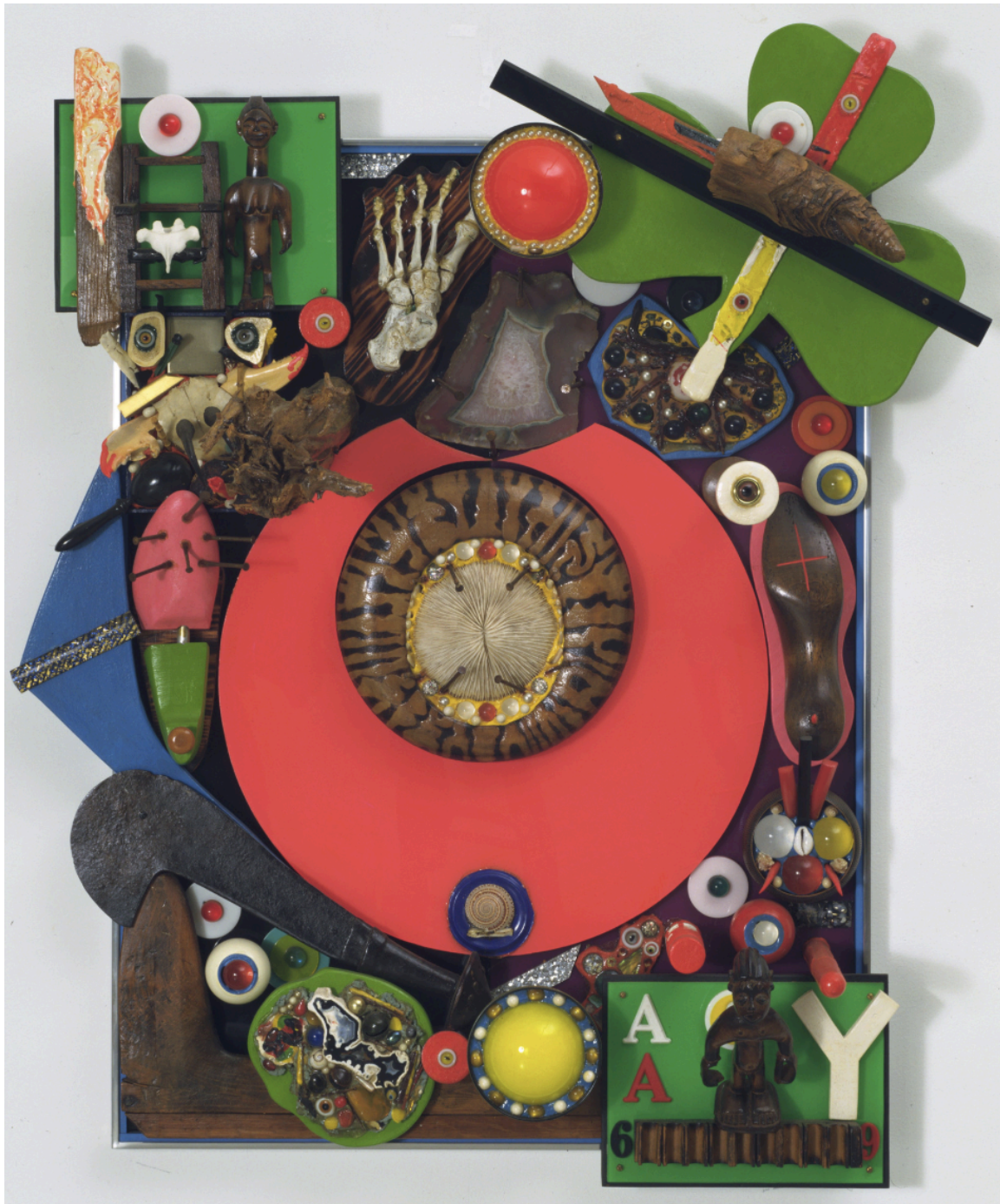
Likhang sining 1: Alfonso Ossorio. Empty Chair or The Last Colonial. 1969