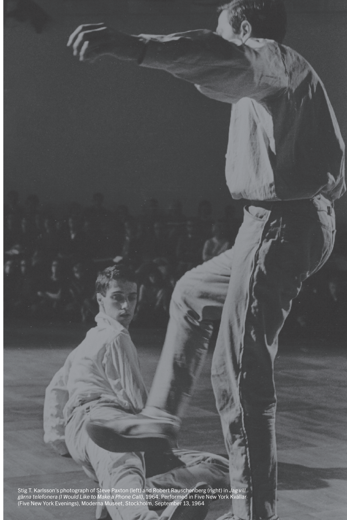
Stig T. Karlsson's photograph of Steve Paxton (left) and Robert Rauschenberg (right) in Jag vill gärna telefonera (I Would Like to Make a Phone Call) , 1964. Performed in Five New York Kvällar (Five New York Evenings), Moderna Museet, Stockholm, September 13, 1964

Steve Paxton's video installation WEIGHT OF SENSATION (2008) is on view from November 19 through November 25. The work features Paxton speaking directly to the camera through a glass table. It will be projected onto the ceiling of the Marron Atrium.