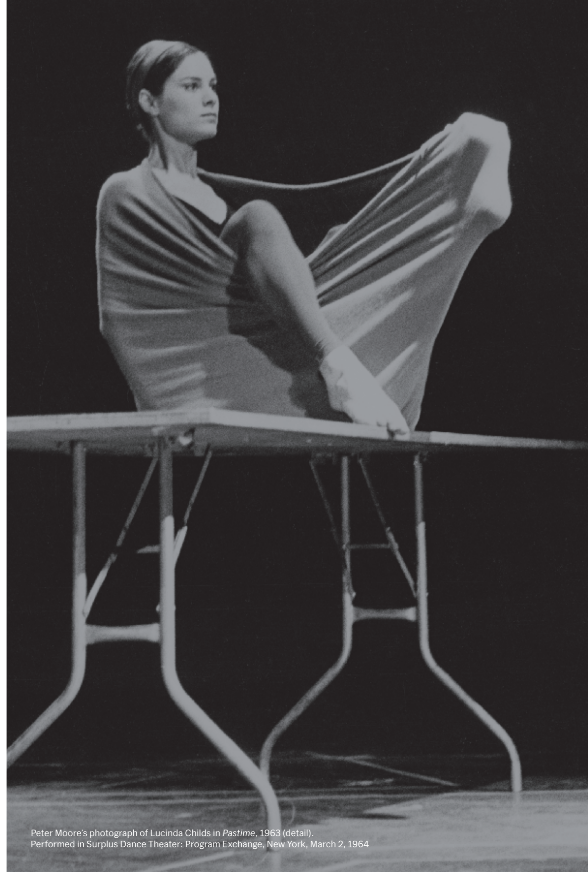
Peter Moore's photograph of Lucinda Childs in Pastime , 1963 (detail). Performed in Surplus Dance Theater: Program Exchange, New York, March 2, 1964

In Lucinda Childs's (American, b. 1940) solo work of the early 1960s, she derived movements from the manipulation of commonplace objects like bed sheets and hair rollers. Childs performed her first work, PASTIME (1963), a three-part dance set to Philip Corner's recorded score of water sounds, in 1963 at Judson Memorial Church. After forming the Lucinda Childs Dance Company in 1973, she choreographed CALICO MINGLING (1976) and RADIAL COURSES (1976), both of which consist of four dancers moving in geometric patterns without musical accompaniment. KATEMA (1978), the final work in this performance program, was originally a solo, which Childs recently reconfigured as a quartet. As in ballet or military ceremonies, the group formations in Childs's works of the 1970s projected what VILLAGE VOICE critic Jill Johnston described as a "hard-edge concentrated impassivity."