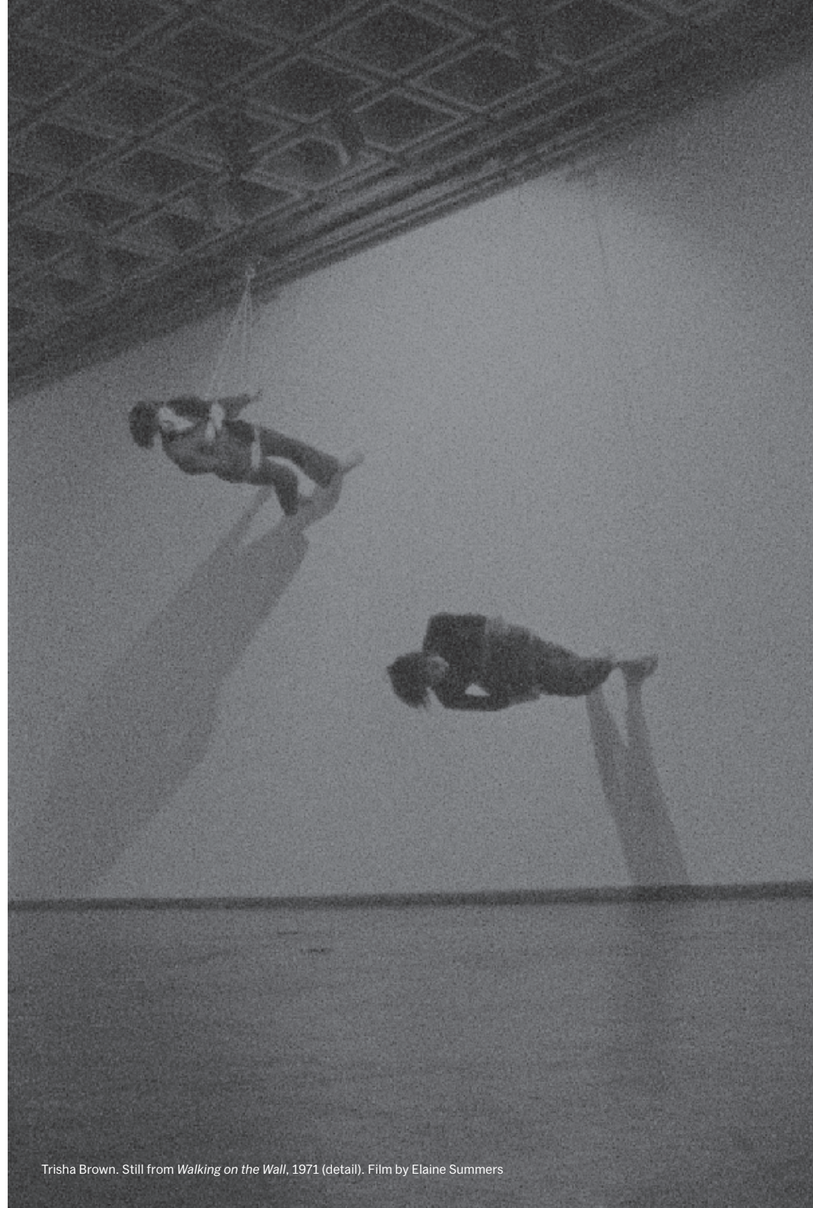
Trisha Brown. Still from Walking on the Wall , 1971 (detail). Film by Elaine Summers