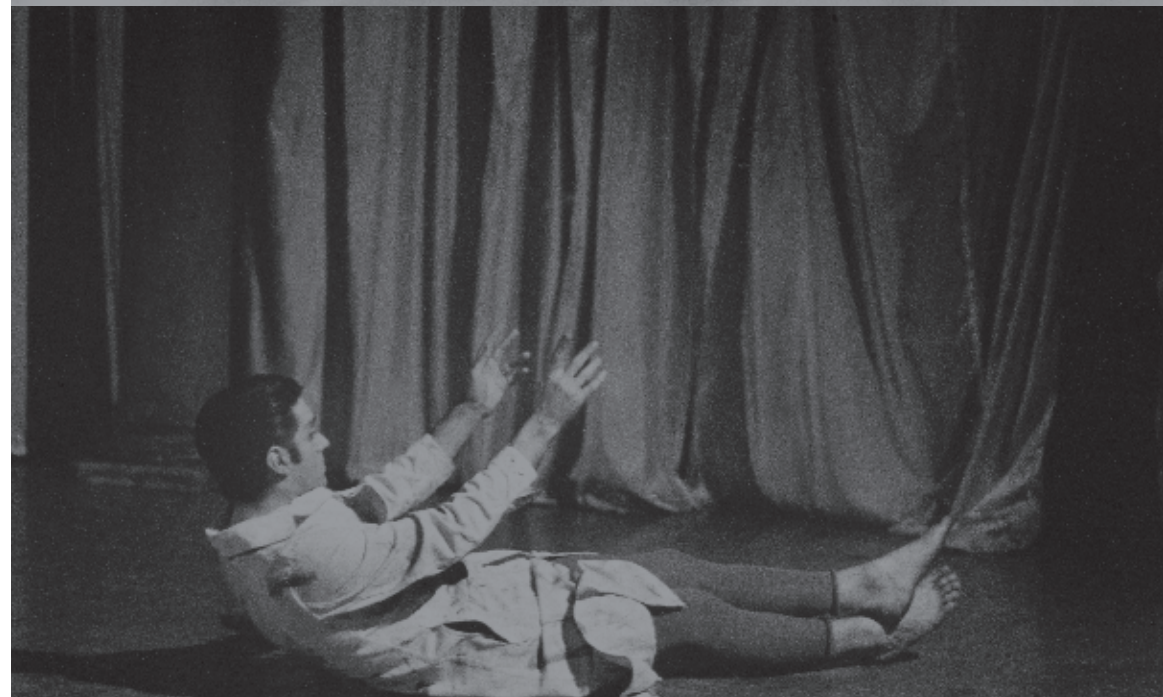
From top: Babette Mangolte's photograph of David Gordon, Valda Setterfield, and unidentified performers in The Matter , 1971. Performed at Merce Cunningham Studio, New York, 1972; Peter Moore's photograph of David Gordon in Mannequin Dance , 1962. Performed in Dance Concert of Old and New Works by David Gordon, Yvonne Rainer, Steve Paxton, Judson Memorial Church, January 10, 1966